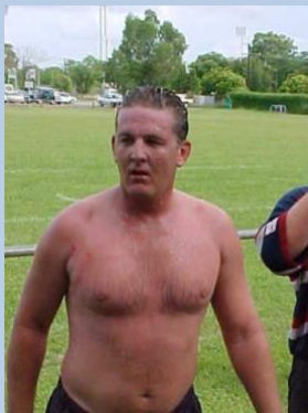
Snogga after a game at Moulden Oval