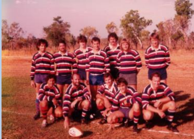
Team from the early 1980's