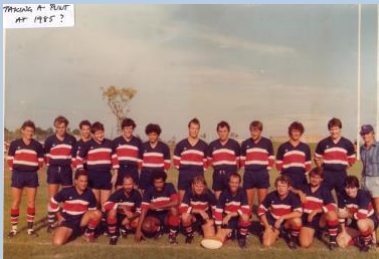
Palmerston A Grade 1985