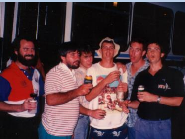
Not so nice Bree