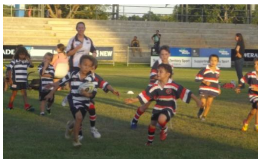
Under 8's Palmerston vs Casuarina last weekend – a preview of our Senior games this weekend.

I wonder how many will be playing A Grade at our 50 th Anniversary?