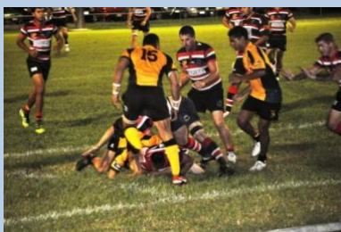
More A Grade action