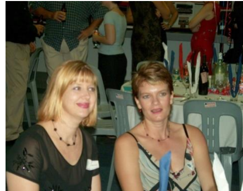
A night for everyone