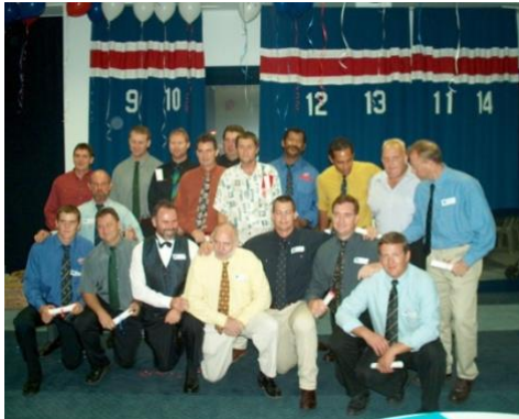
Team of the 25 years

With our 35 th Anniversary just over two months away, we thought we'd reminisce with some photos from our 25 th Anniversary dinner, held at the Chan Building back in 2002.