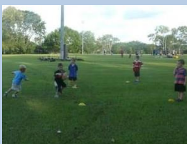
Under 6's at training