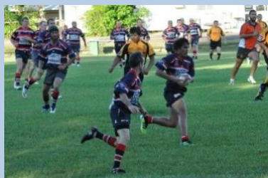
Under 10's at half time