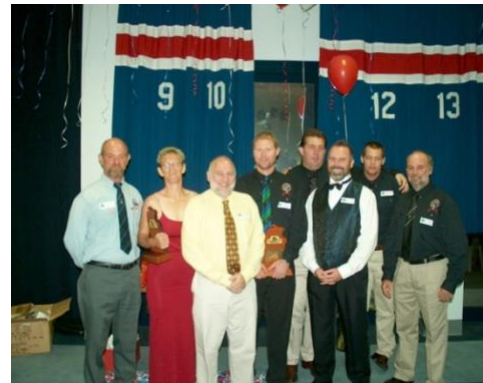
Life Members as at 2002