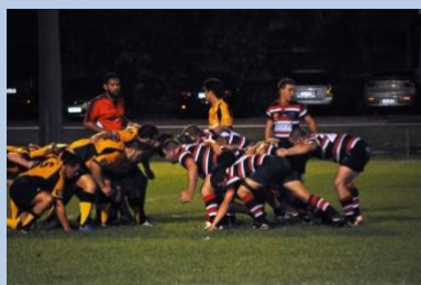
A Grade vs. Dragons