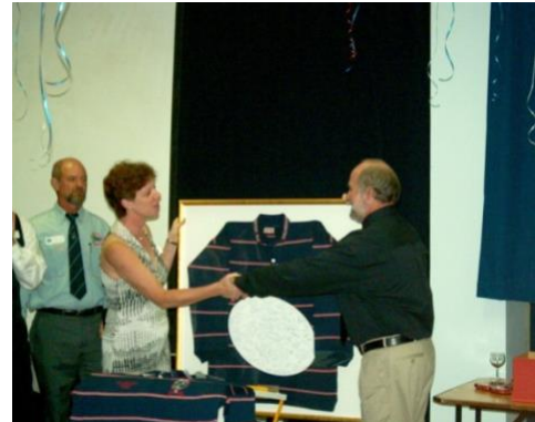
Former Chief Minister Claire Martin