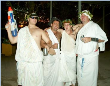
Toddy in a toga