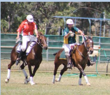
Toddy the Polocrosse player