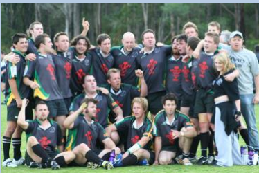
Playing for the Margaret River Gropers