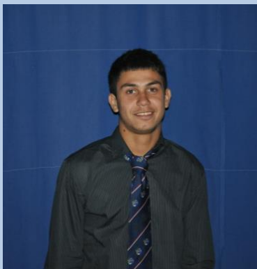
At Presentation Night