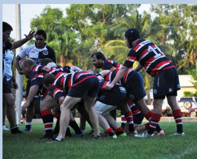
B Grade vs University