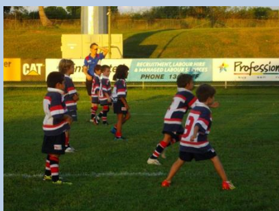
Under 8's at kickoff