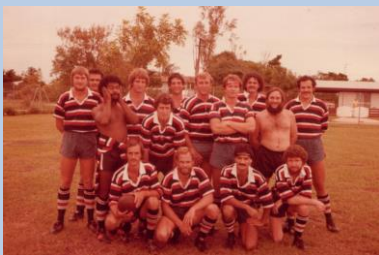
The early years