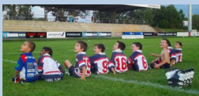
Under 8's (watching the jet fly overhead!)