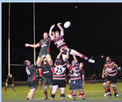
A Grade vs Souths