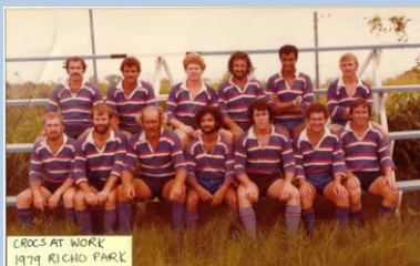
Palmerston Crocs, 1979