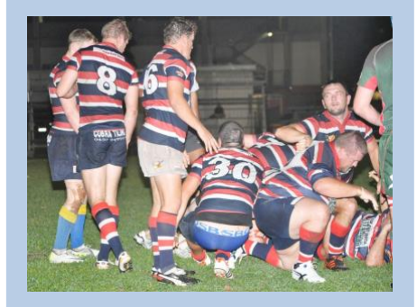
B GRADE v SOUTHS