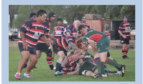
UNDER 18s v UNIVERSITY