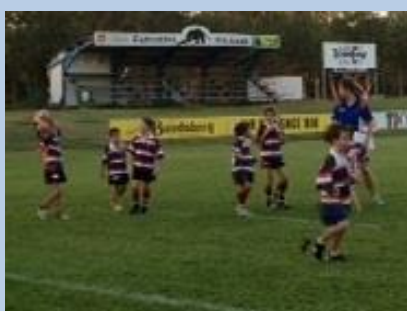
Another try scored