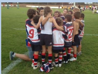
Celebrating after the game

couldn't close the game out. We led 19 - 15 with 5 minutes to go but Casuarina scored 2 late tries to take the game 25 - 19.