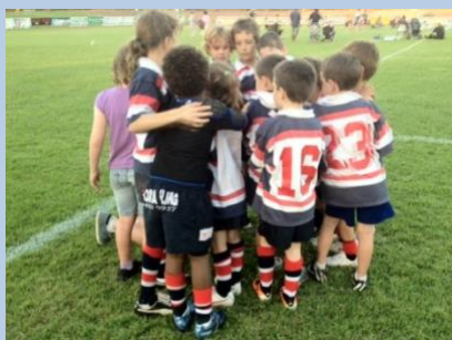
Talking tactics at ½ time