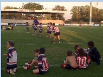
The reserve bench