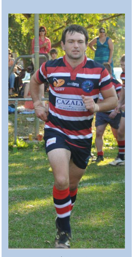
A Grade Captain