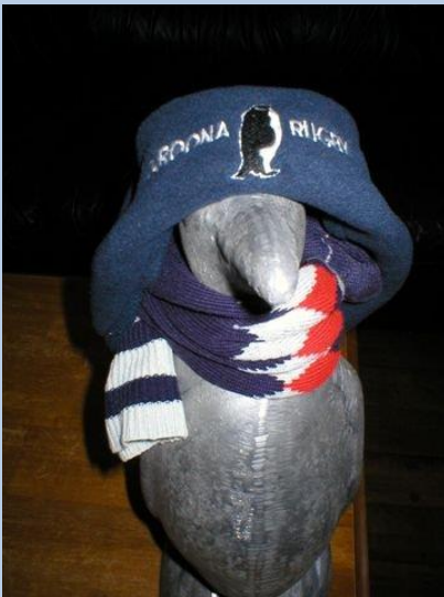
Tassie rep photo, images of penguins