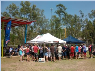
At the Palmerston Water Park