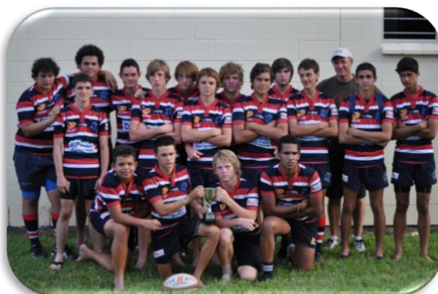
The Under 16's after winning the TIO NT Junior Championships in May

We hope that all of the boys realise what a special year it has been for them as a group and we hope to see every one of them return for a bigger and better year in 2013.