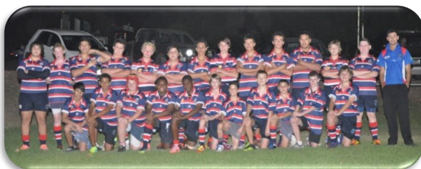
Under 14's - Minor Premiers 2012

All in all, it has been a fantastic season which has been a lot of fun for everyone involved. Hopefully we will see you all back next year, and hopefully we can go one better.