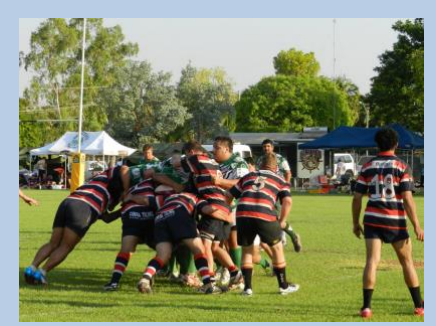
Palmerston vs. Alice - game 3