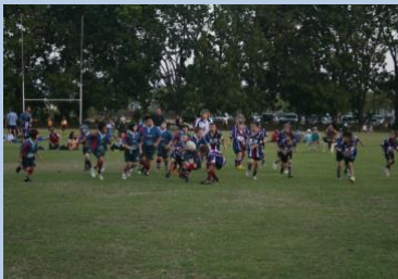
2011 Under 9's game action

"Well as you know i have quite a bit of hair ... but it's getting the chop! I am going to be shaving for a cure on the weekend of march 15 - 17 th ".