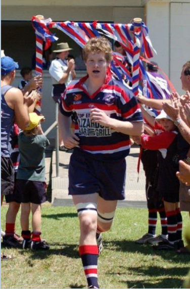
Running on for the B Grade Grand Final in 2006.