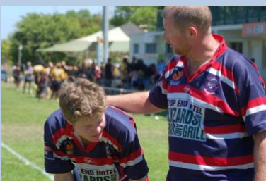
With Dad, Boulder