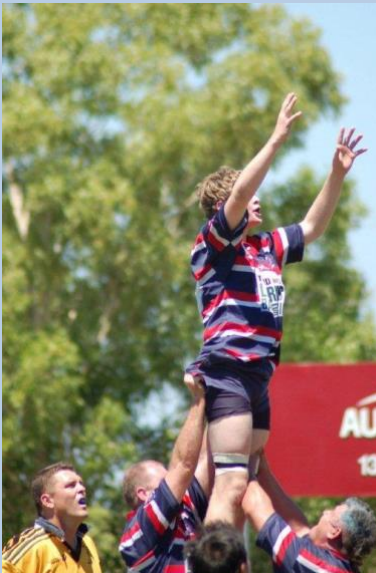
Grand final action.