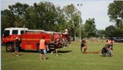
The Firefighter Championships 1