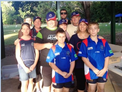
The Grainger/Akers, Hakes and Sack families at the early morning breakfast shift.