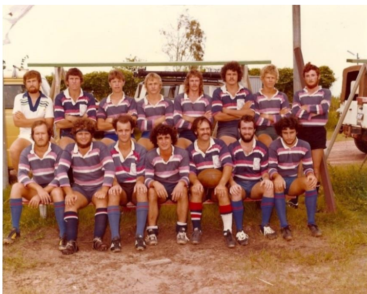
Palmerston RUFC B Grade 1978