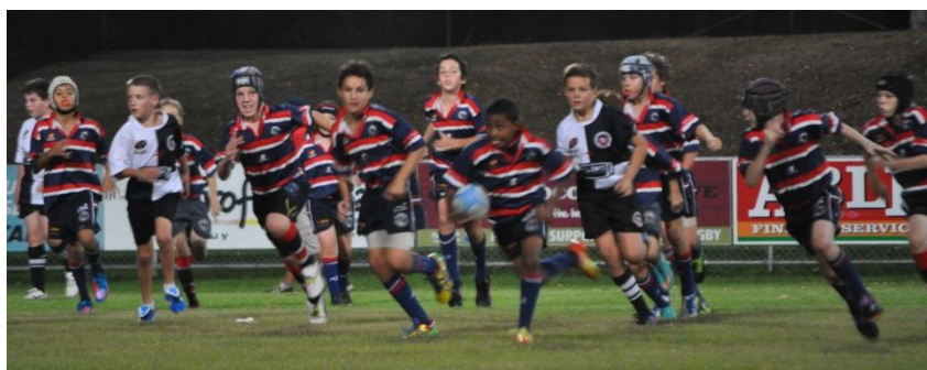
Under 12s in superb form