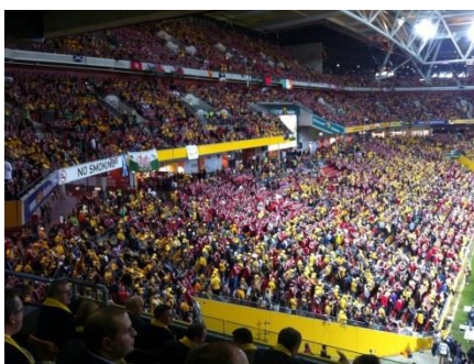
A sea of gold and red

As the Lions tour is such a significant event, many club members have travelled interstate to watch the games. Both the Brisbane and Melbourne games have been nail biters: in Brisbane, the Lions won 23-21 with the Wallabies missing a penalty goal that would have won them the match right on the final siren. In Melbourne the result was reversed; the Wallabies won 16-15, with the Lions missing a penalty goal after the siren that would have won them the game. This weekend promises to be another great game. Watch it free to air at 6.30pm on Channel 10.