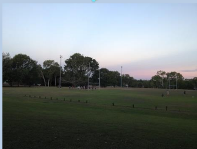
A green Moulden Oval!