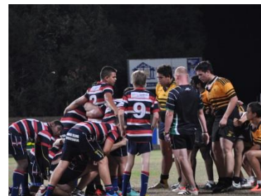
Under 16s last Friday

All nominated players will need to attend the trial game. Details are as follows: