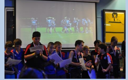
... some of the U12s...