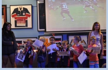
U6s and their coaches...