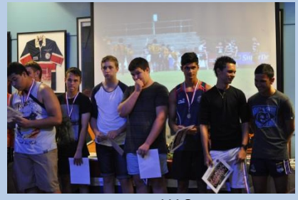
... up to U16s.