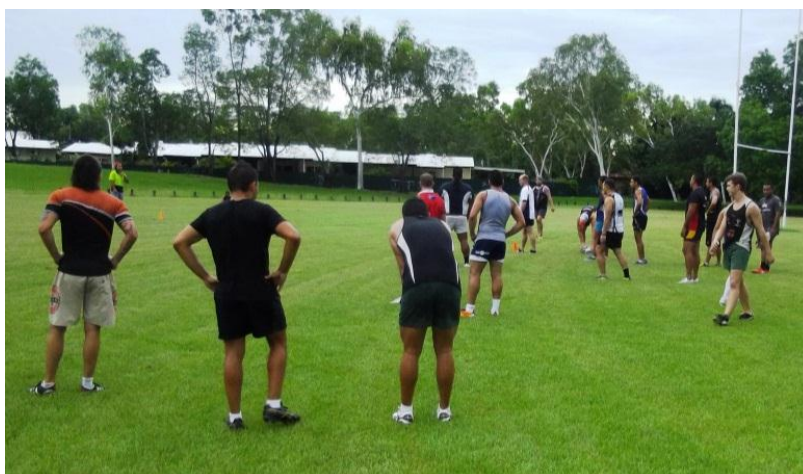
7s training at Moulden Oval