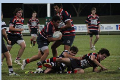
Under 18s, 2012