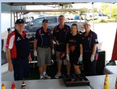
The first and second shifts.