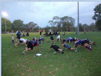
Under 12s warming up