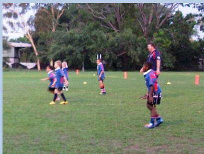
Palmerston Crocs U8s