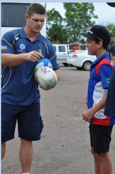
Signing the Palmy ball