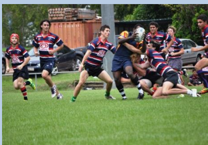
Under 18s make a tackle