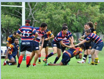
Under 18s v St Johns