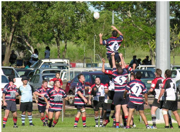
The A Grade showing they also know their way around the lineout