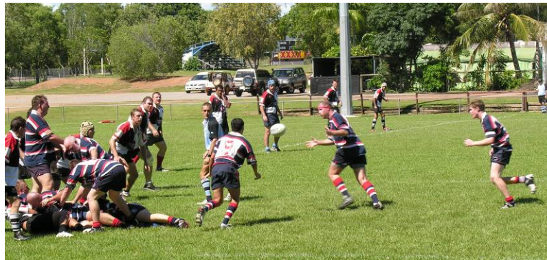
Father and son take off on another attacking raid.