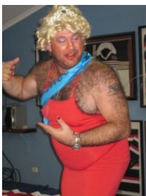
This Year's Winner