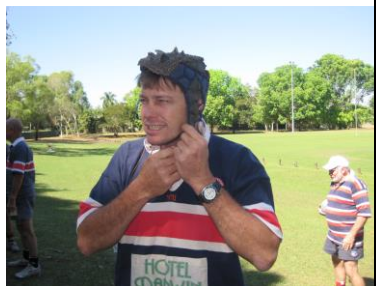
New headgear to scare the opposition's scrum!