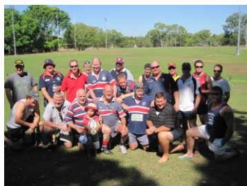
The "Dream Team"